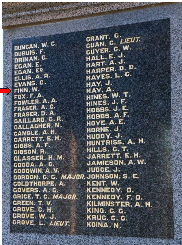
Inverell War Memorial