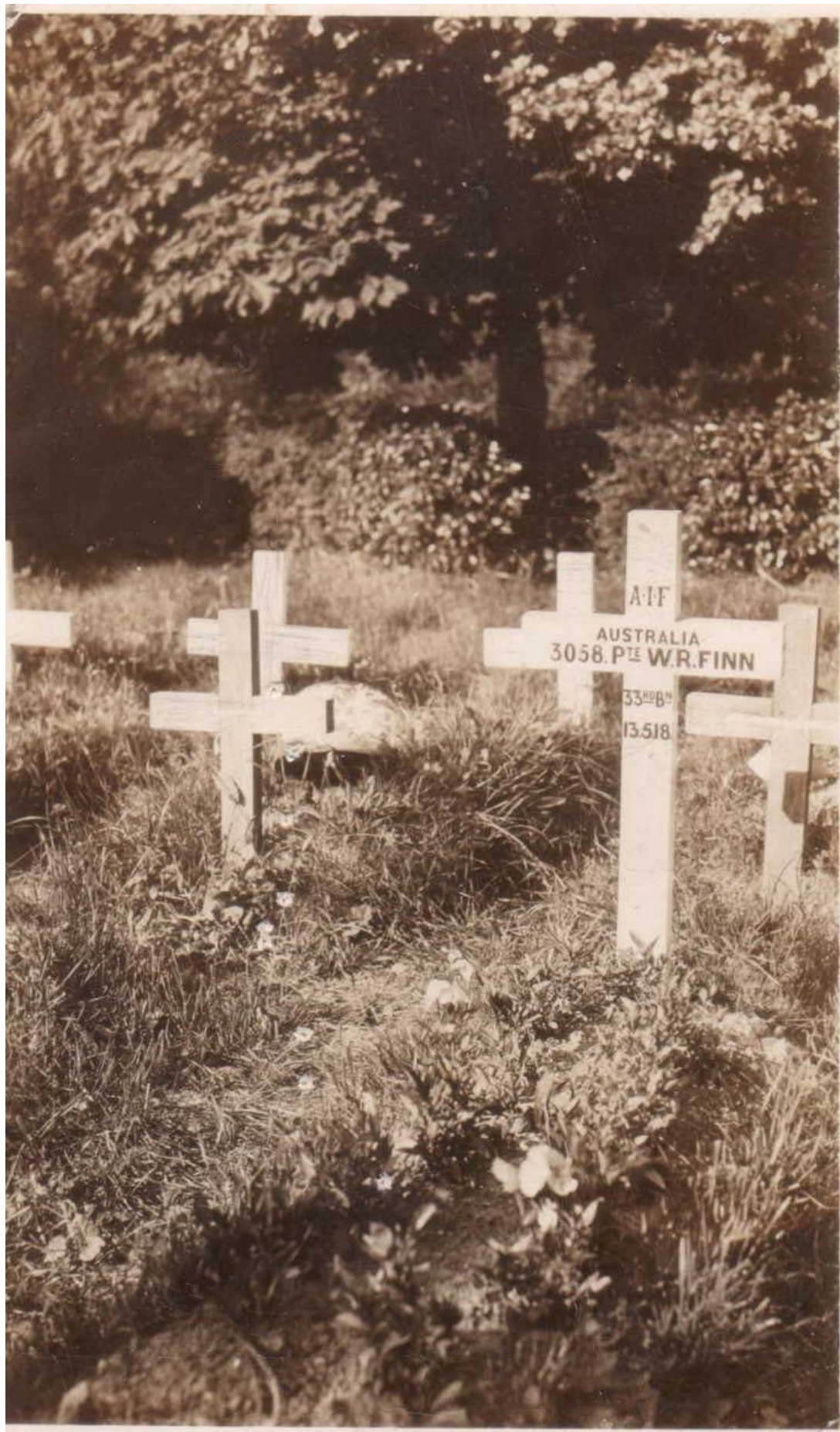
Original Grave Marker